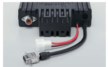
Photo shows optional OPC-1939 installed on high power version.

With the optional OPC-1939 D-SUB 15-pin ACC cable, the IC-F5023/H series can be programmed to control an operating channel from an external device (up to 16 preprogrammed channels). The ACC connector also provides an ignition sensing function, external PTT, PC command, horn honk, audio output and modulated signal input depending on programming.